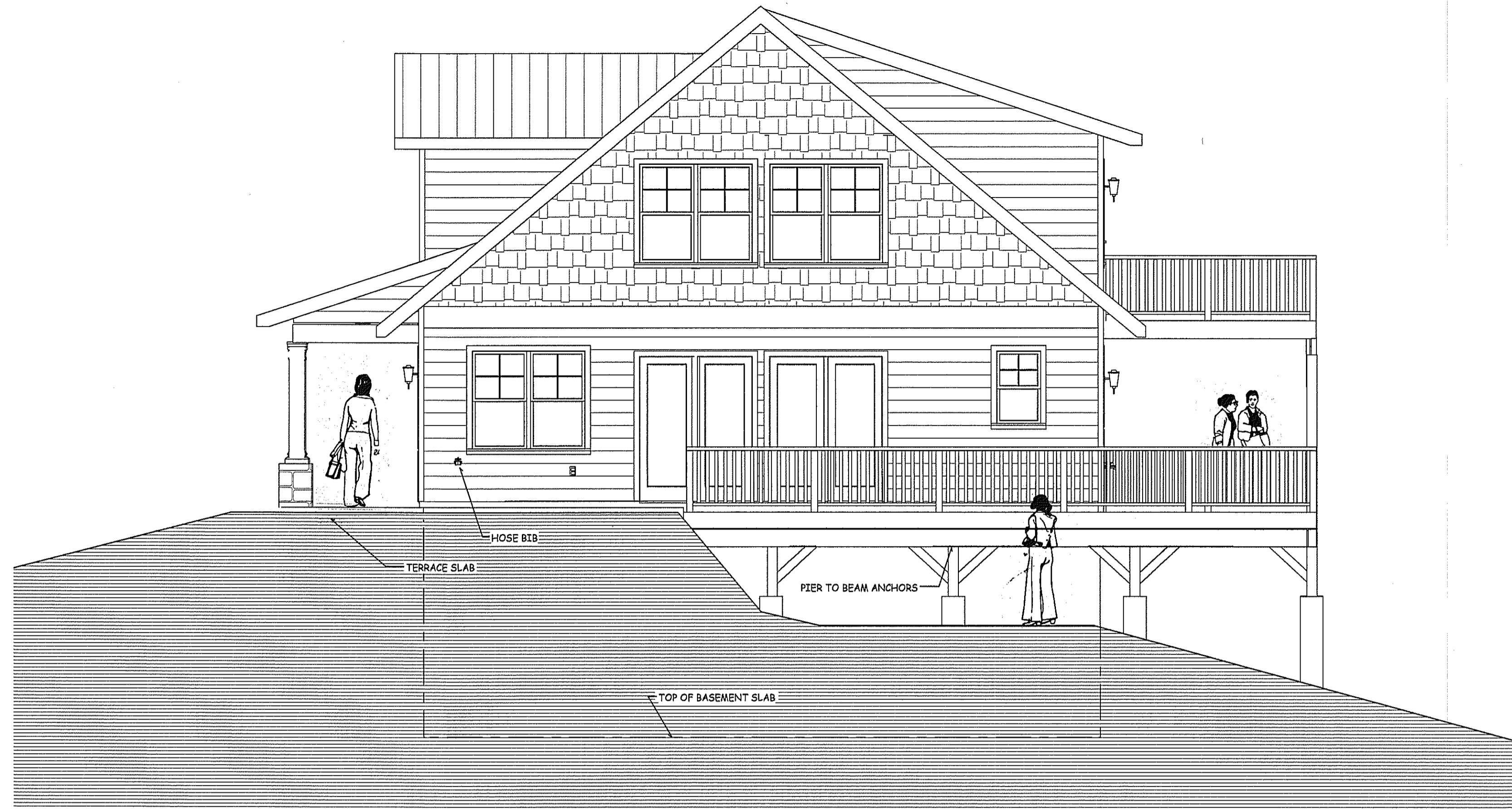
4 6 HOUSE: EAST FACING ELEVATION